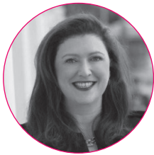
The Hon. Natasha Maclaren-Jones Legislative Council Government Whip