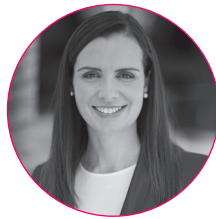
The Hon. Courtney Houssos Parliamentary Secretary to the Shadow Cabinet